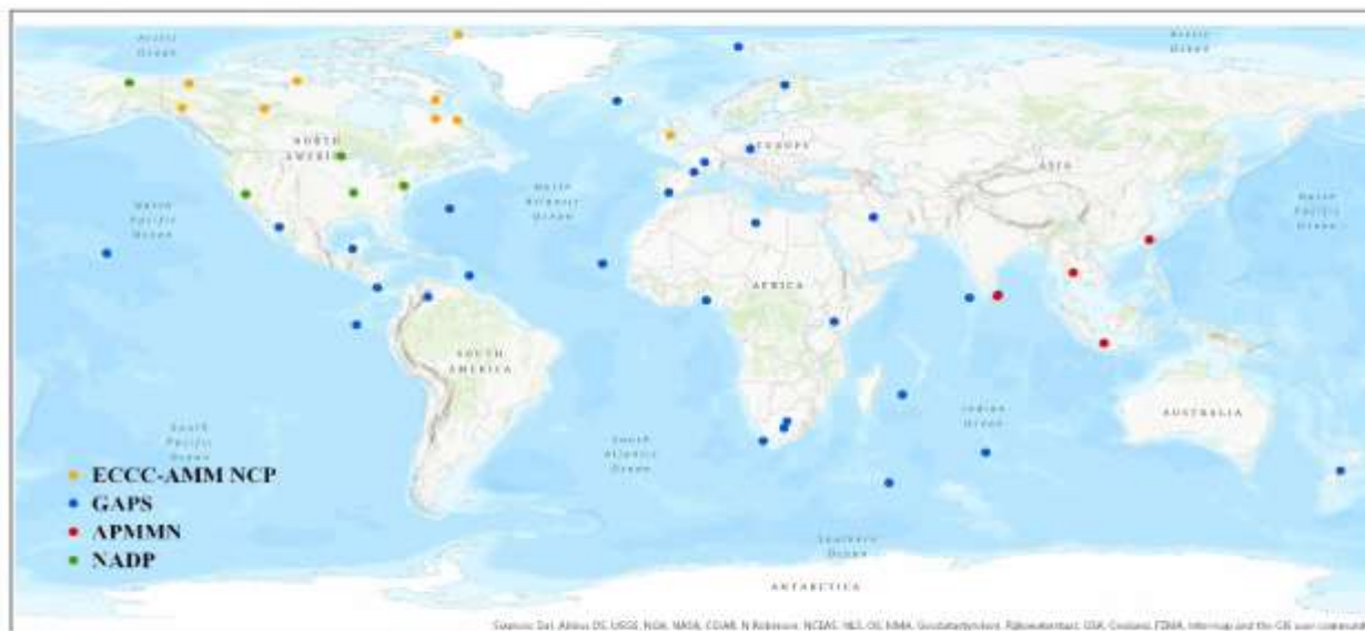
121 122 Figure S.1. Forty-seven active sites across the globe being actively monitored by Environment and Climate Change 123 Canada – Atmospheric Mercury Measurement – Northern Contaminants Program (ECCC-AMM-NCP) in 124 collaboration with the Global Atmospheric Passive Sampling (GAPS) network, the Asia Pacific Mercury Monitoring 125 Network (AMPPN), and the American-led National Atmospheric Deposition Network (NADP) as of January 2021.

117 a mercury passive sampler that was developed in Italy), and currently operating networks may 118 independently initiate their own passive sampling at select sites and an intercomparison of techniques 119 could be made. The data generated by the study will be properly quality controlled with accepted 120 standard methods (e.g. EPA method 7473) and housed on the ECCC data portal.