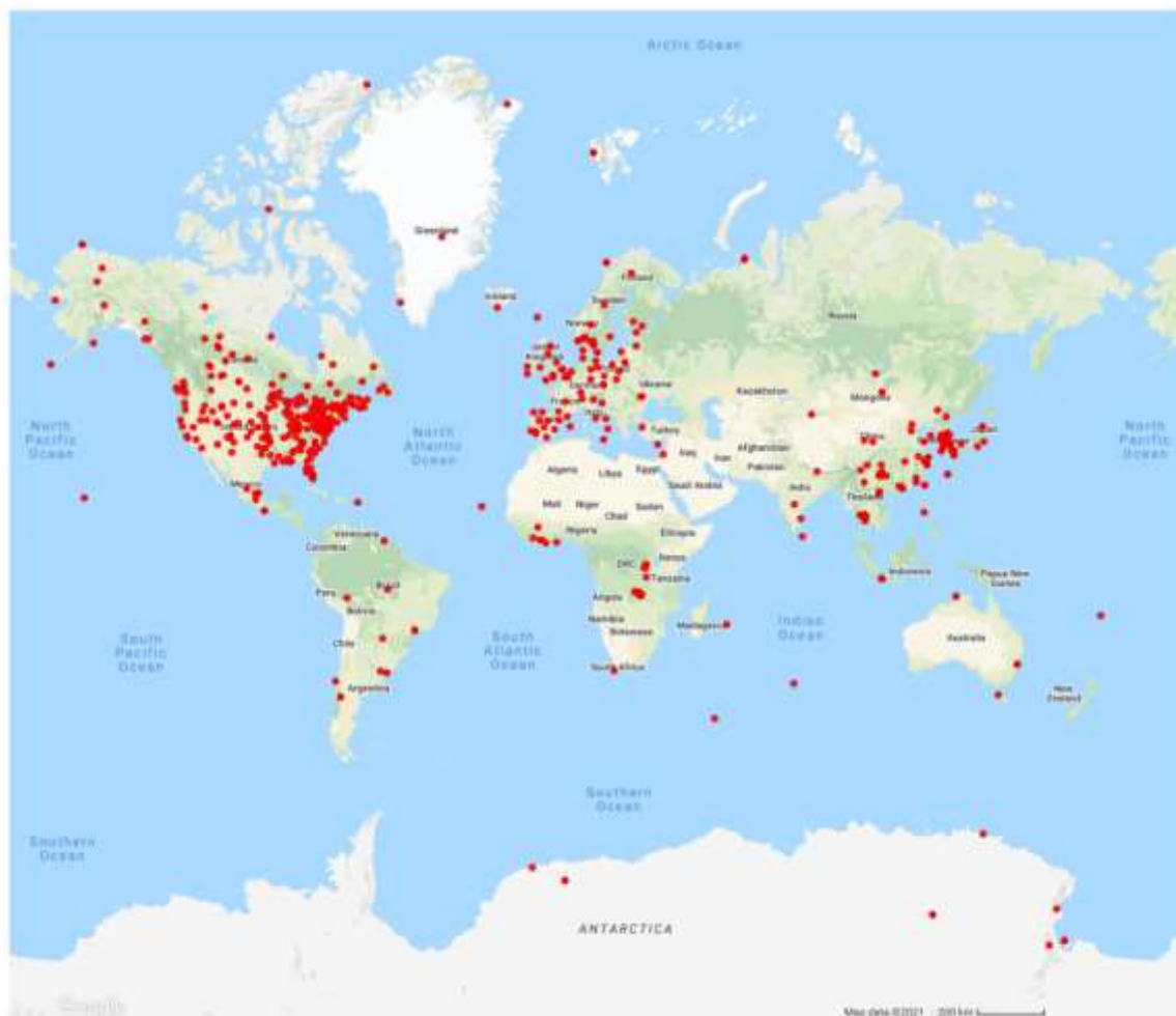
301 302 Figure S.2. Existing monitoring networks measuring mercury concentrations in air. [The information in 303 this figure is outdated and will be updated in the coming weeks following a call for submission of 304 information on existing monitoring programmes] 305