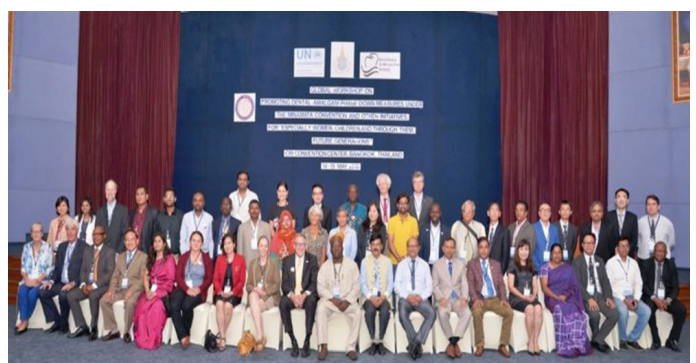
Figure 3: ‘Leapfrogging’ in mercury dental amalgam phase down.