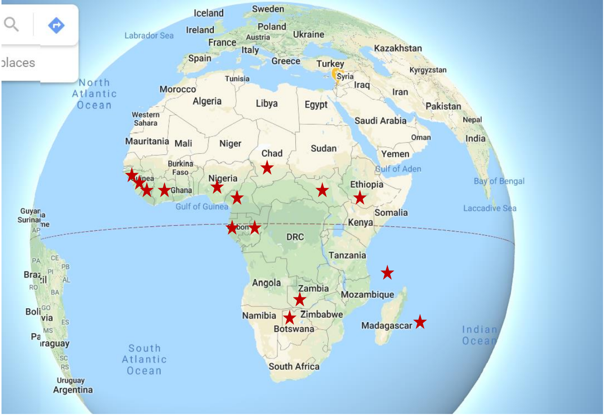
Map showing the Countries that returned their survey Forms