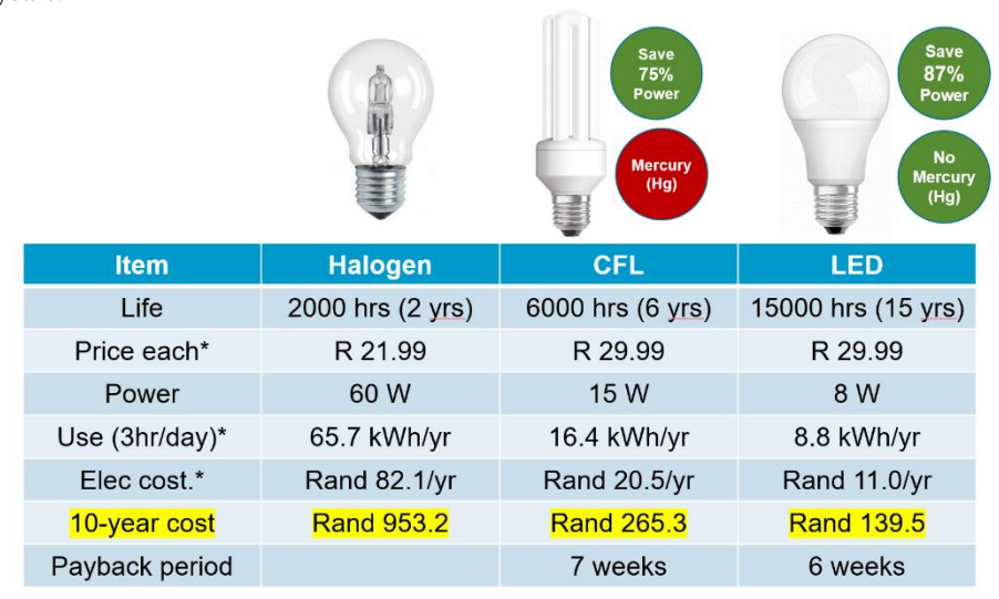
Figure 1. Payback Period for a General Service LED Lamp in South Africa

The examples below show the cost-effectiveness of LEDs compared with other lighting in South Africa and Uganda. Assuming the bulbs operate for 4 hours per day, the payback periods for LED lamps are only a matter of weeks – yet the lamps operate for years.