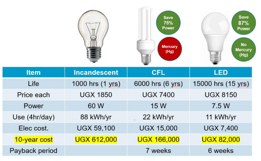
Figure 2. Payback Period for a General Service LED Lamp in Uganda

Similar analysis of general service lamps in Madagascar found that the payback period of moving from incandescent bulbs to an LED retrofit is just 3.5 months. And the net-present value of the savings over a 10-year period (including bulb purchases and electricity to operate the bulb), discounted back to today's value is MAG 560,700. These savings – over half a million Malagasy ariary – far exceed the higher purchase price of the LED (which is MAG 16,100 more expensive than an incandescent lamp).