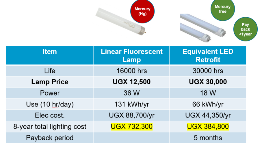
Figure 4. Payback Period for a T8 Magnetic Fluorescent Lamp, Uganda

In Uganda, the payback period for the same LED retrofit bulb is even shorter because the difference in first cost between the fluorescent and the LED tube from the wholesaler is not as large as in South Africa. In both countries the payback period is less than one year.